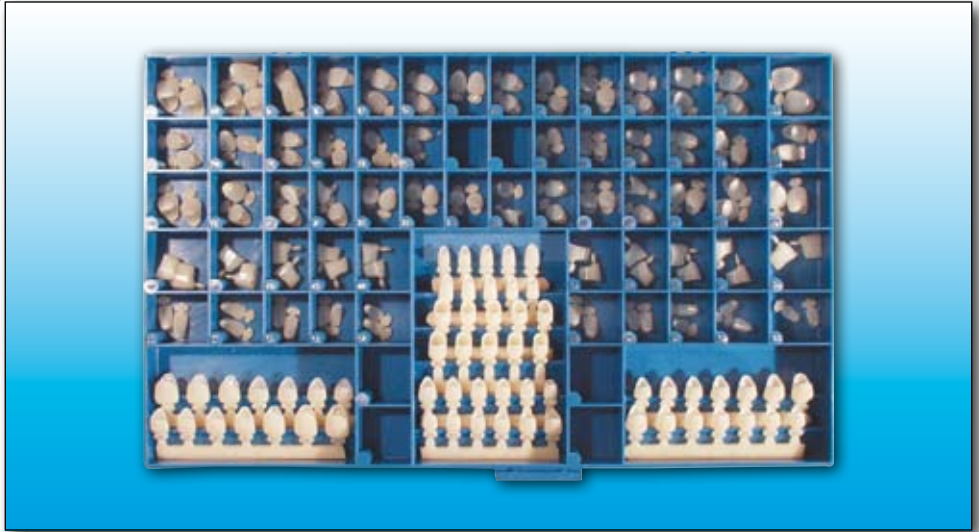
Art. no. 2195. Anteriors and Premolars in 60 different sizes. Ass. box of 180 crowns, with mould guides.